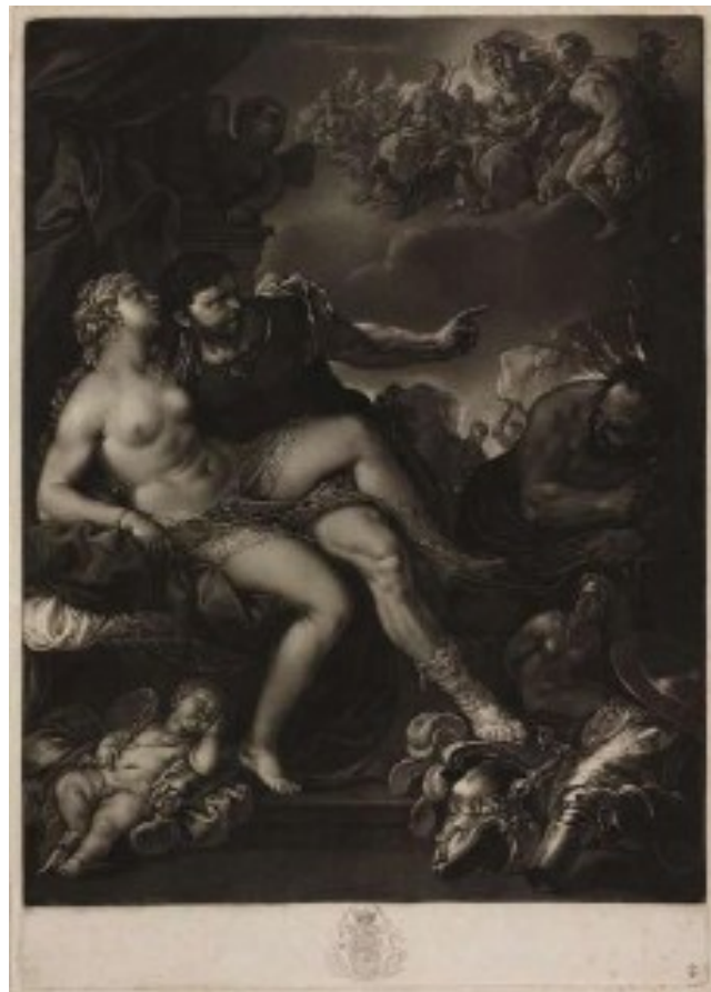
Figure 2 Engraving by Johann Peter PICHLER